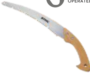
Super Turbocut Pruning Saw - PR 32 CW