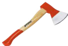
Forestry Hatchet - AX 6