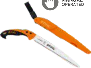
Pruning Saw Megacut - PR 24