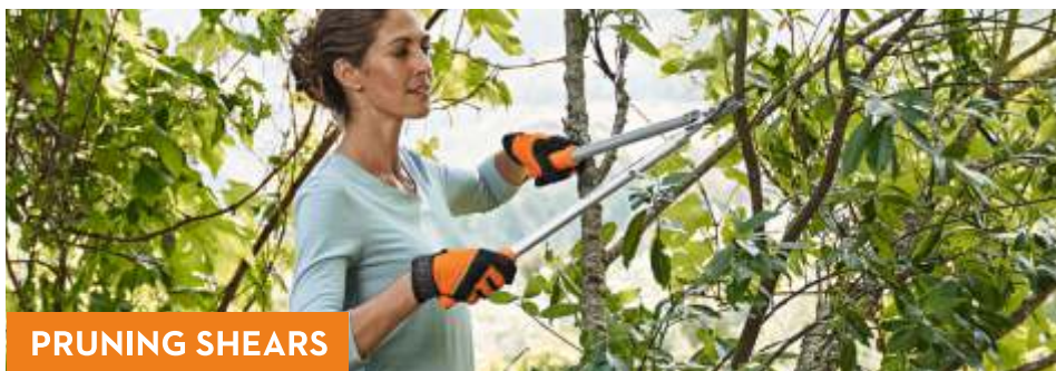
Secateurs Amboss - PG 25