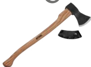
Forestry Hatchet - AX 12 T