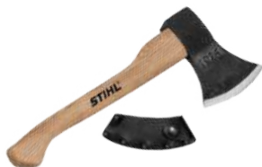
Forestry Hatchet - AX 7 T