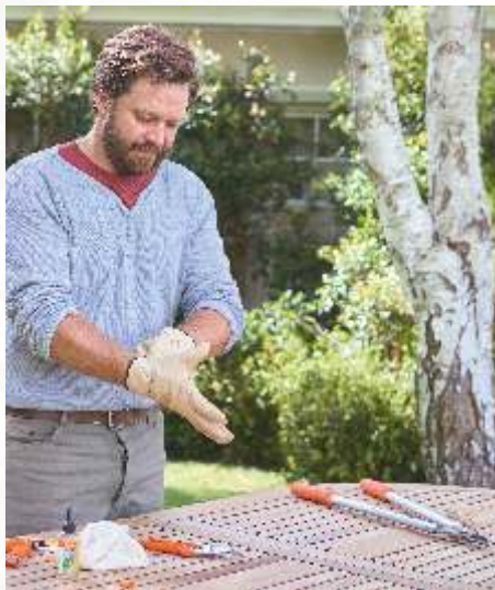
HAND TOOLS AND ACCESSORIES