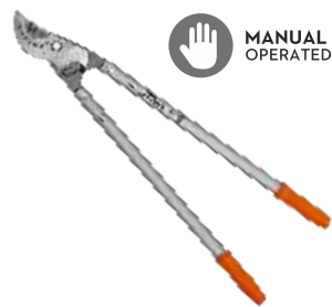
Anvil Pruning Shears - PB 35