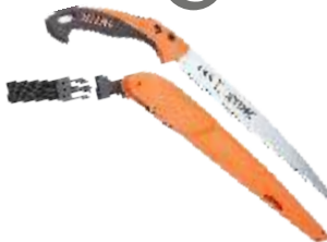
Pruning Saw Megacut - PR 33