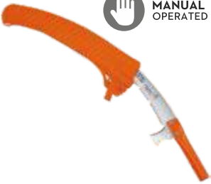
Super Turbocut Telescopic Saw - PR 40 CT