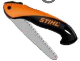
Pruning Saw Handycut - PR 16